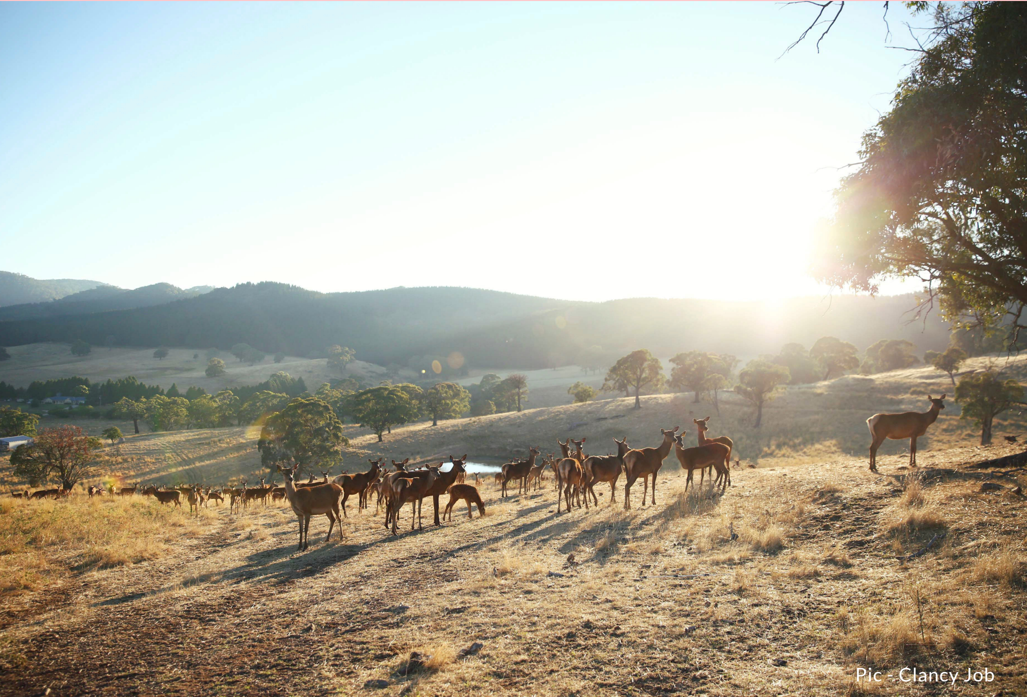
Pic - Clancy Job