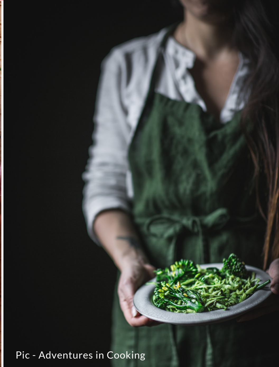
Pic - Adventures in Cooking